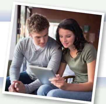
Not actual patients.

MyPfizerBrands VALUABLE OFFERS. Rx SAVINGS.