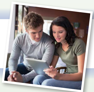
Not actual patients.

MyPfizerBrands VALUABLE OFFERS. Rx SAVINGS.